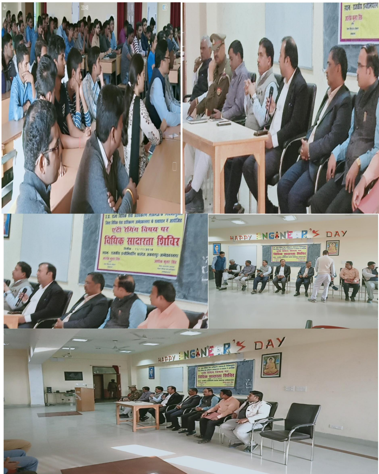
Anti Ragging “Vidhik Saksharta Shivir” in CSA Hall@REC Ambedkar Nagar