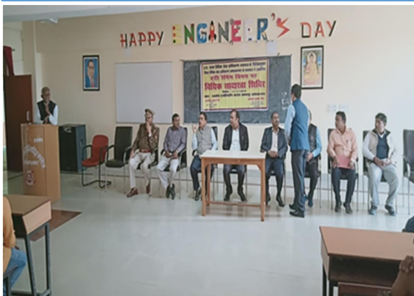
Anti Ragging "Vidhik Saksharta Shivir" in CSA Hall Rajkiya Engineering College (R.E.C) Ambedkar Nagar, U.P. India.