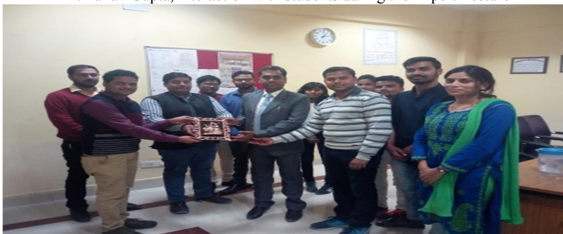
Closing Ceremony of Expert Lecture