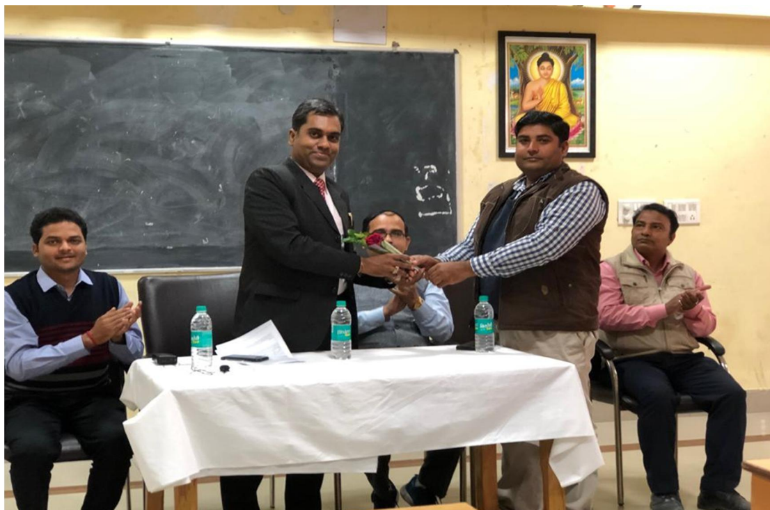
Inaugural Ceremony of the Expert Lecture in CSA Hall on 30 th Nov., 2018