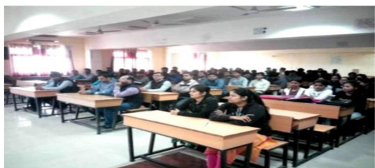
Inauguration Ceremony of IEEE student Branch of REC Ambedkar Nagar (STB-11386)